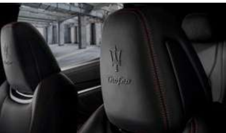
Levante Trofeo - Headrest detail