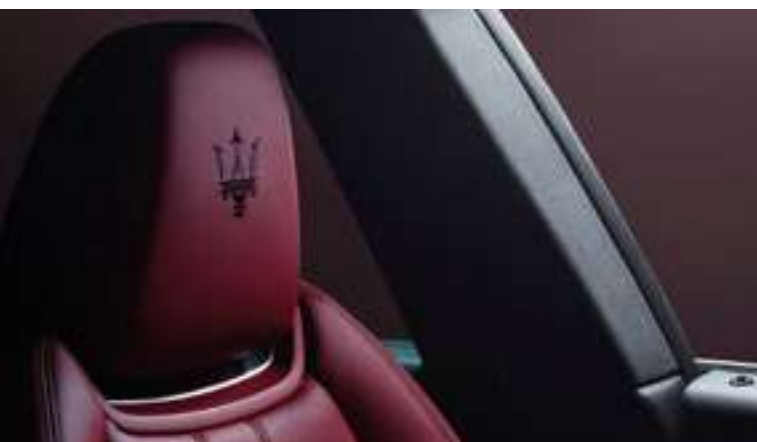
Levante - Headrest detail