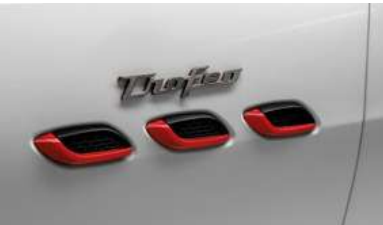
Levante Trofeo - Side air vents and Trofeo Badge