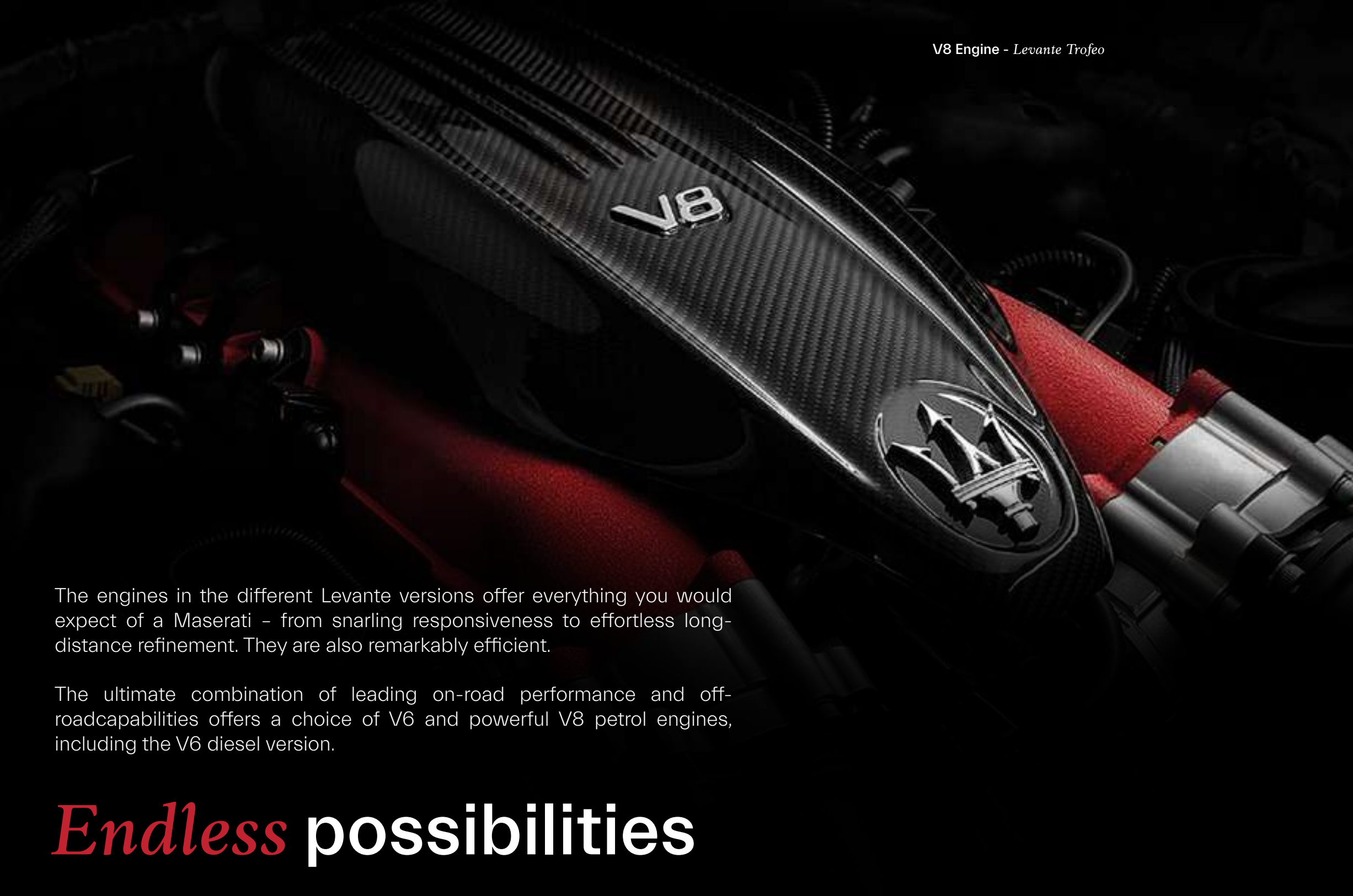
V8 Engine - Levante Trofeo