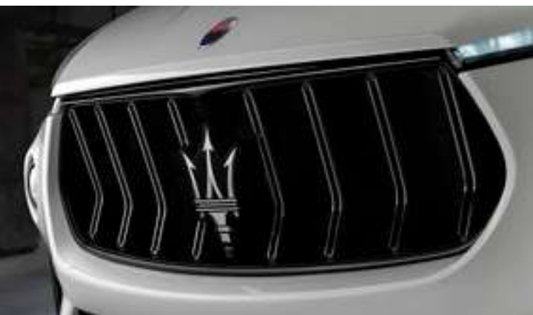
Levante Trofeo - Grille

Born from a passion for the racetrack, the Levante Trofeo is created to maximize your emotions , no matter the terrain.