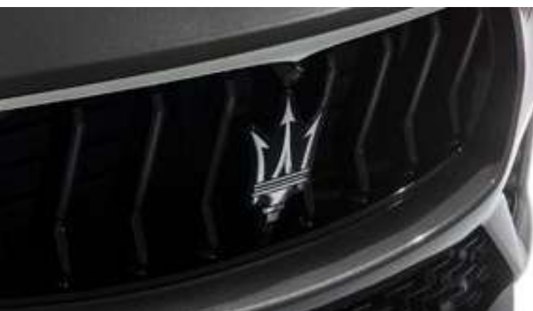
Levante - Grille