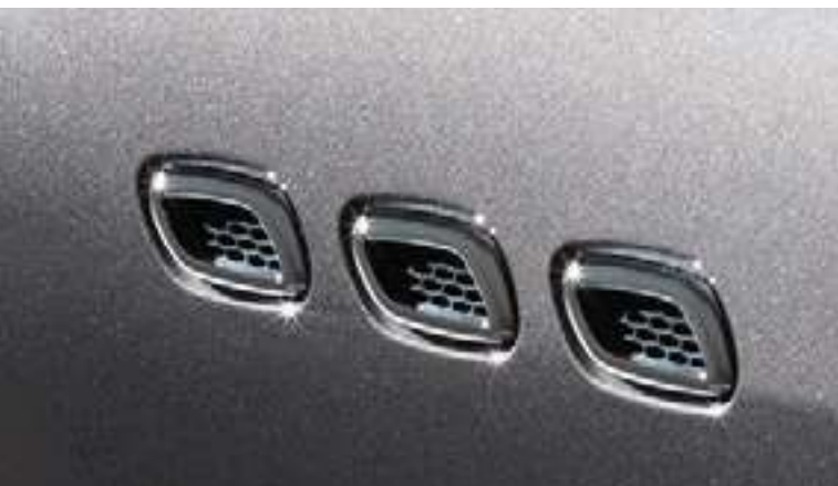
Levante - Side air vents