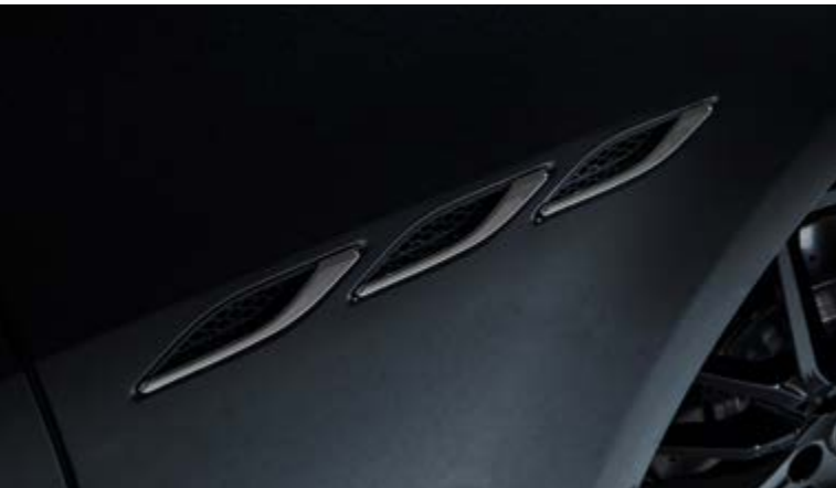
Ghibli - Side air vents