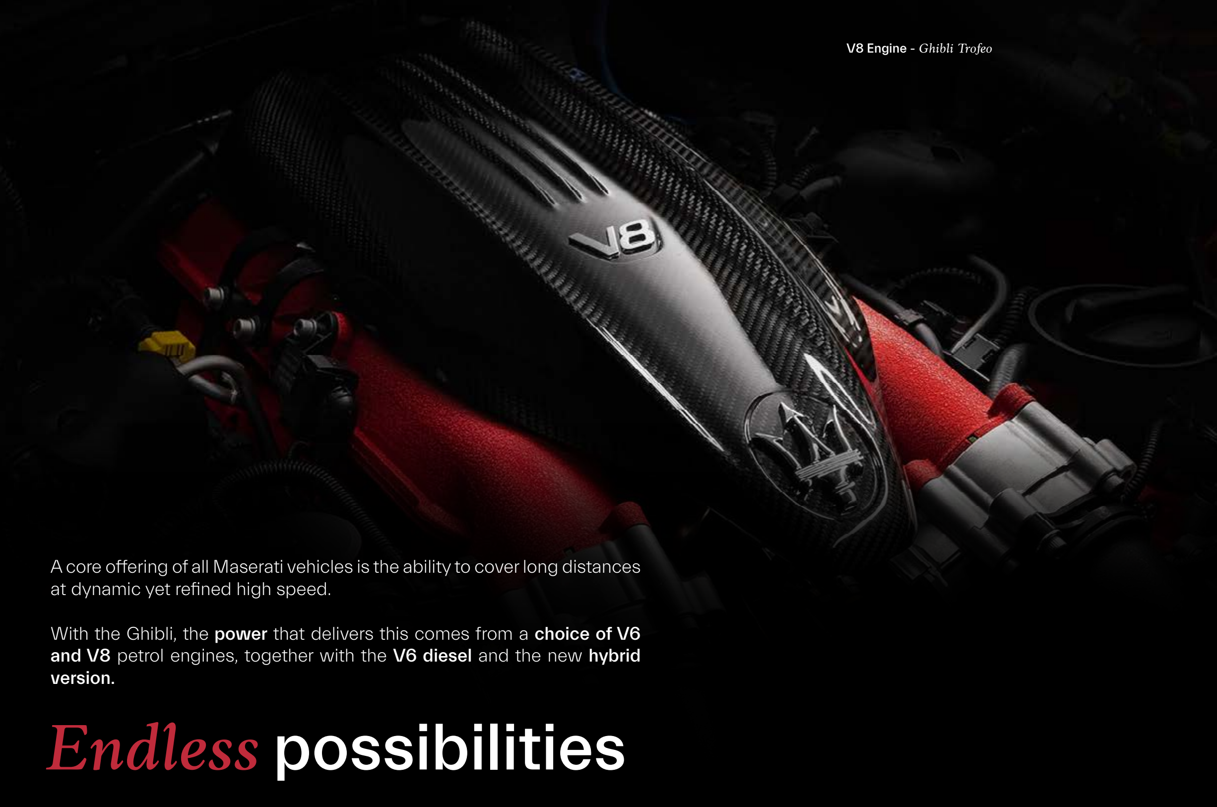
V8 Engine - Ghibli Trofeo