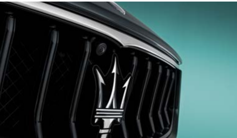
Ghibli - Grille