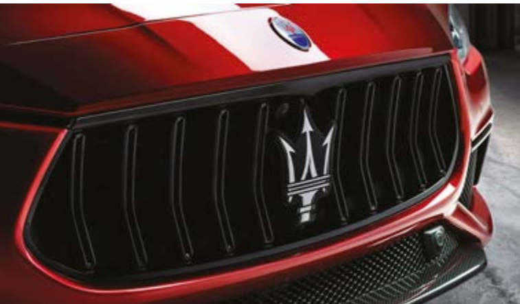
Ghibli Trofeo - Grille

Live audacious. Drive with character. Stand out in just 4.3 seconds with the ultimate Maserati Ghibli Trofeo. With 580 hp and a top speed of 326 km/h, the Trofeo is the most powerful Ghibli ever . Your bold statement that redefines the art of possible. The striking coupé look of the Ghibli, intensified by race-inspired design elements. High-gloss Carbon fibre on the front, the rear and on side air intakes, and the sculpted Trofeo bonnet with air extractors give you just a taste of what awaits as you grab its steering wheel . That's how Ghibli Trofeo came to life. Born from race, enhanced by comfort with an innate sense for timeless beauty.