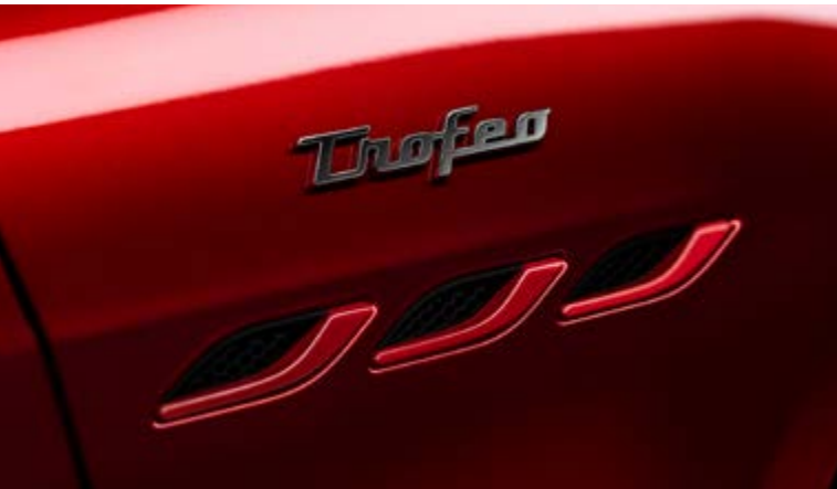
Ghibli Trofeo - Side air vents and Trofeo Badge