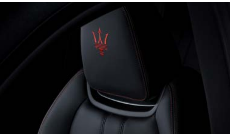
Ghibli - Headrest detail