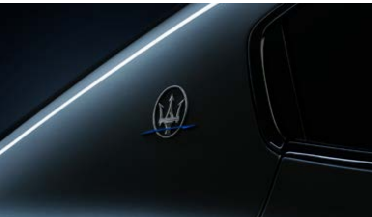
Ghibli Hybrid - Iconic Saetta logo on C-pillar

The natural world is full of moments where a single spark evolves into something new – an instant where hybridization acts the catalyst for change. From the same inspiration comes the new Maserati Ghibli Hybrid : the first in a line of new vehicles, at the vanguard of a new Era for the Brand . The Ghibli Hybrid ignites Maserati's future without betraying the past. The first hybrid engine in the history of the marque, where innovation and technology have always met with high performance automotive engineering, to drive Maserati forward towards a more sustainable future. Faster than diesel, greener than gasoline: the Ghibli Hybrid philosophy in a nutshell.