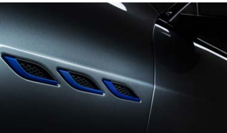
Ghibli Hybrid - Side air vents