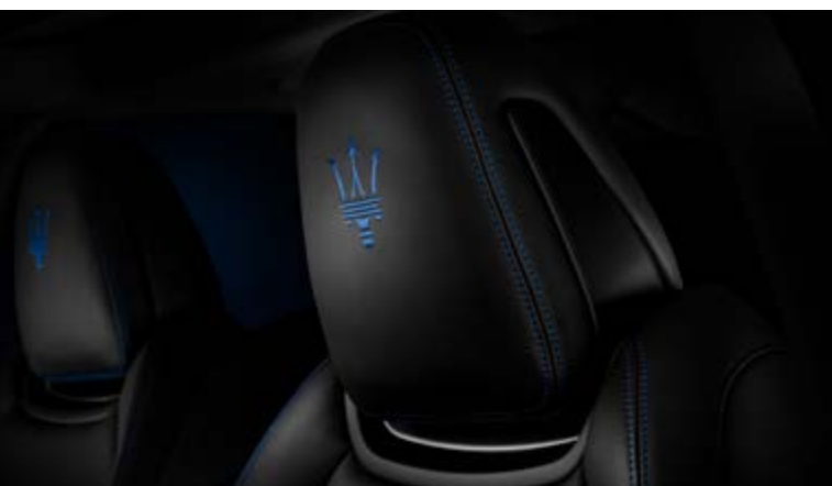
Ghibli Hybrid - Headrest detail