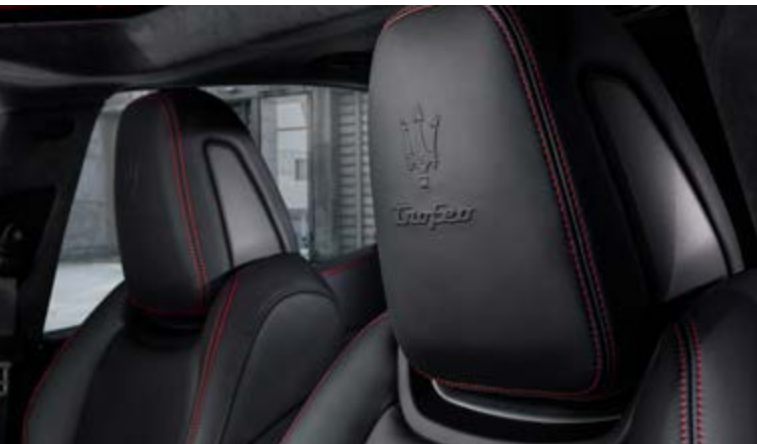
Ghibli Trofeo - Headrest detail