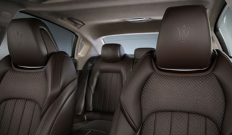
Quattroporte - Headrest detail