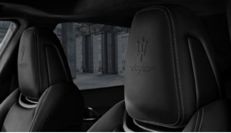
Quattroporte Trofeo - Headrest detail