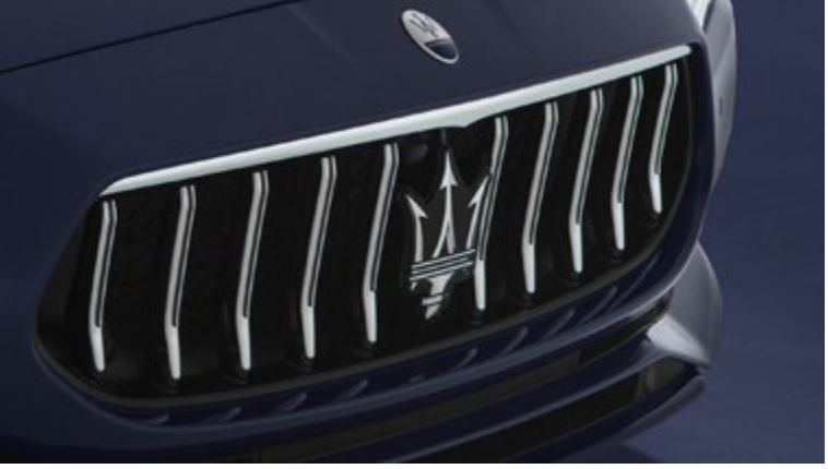
Quattroporte - Grille