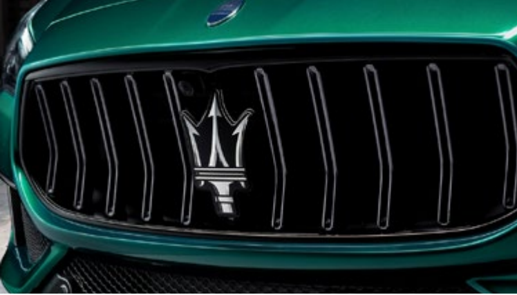
Quattroporte Trofeo - Grille