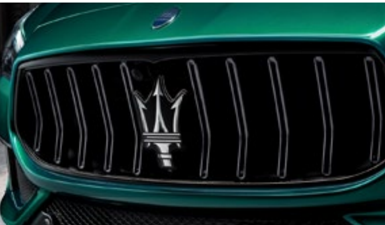
Quattroporte Trofeo - Grille

The fastest, the finest. The powerful icon that is the Quattroporte takes luxury grand touring to unprecedented levels of performance. For those who belong in the fast lane of exclusivity.