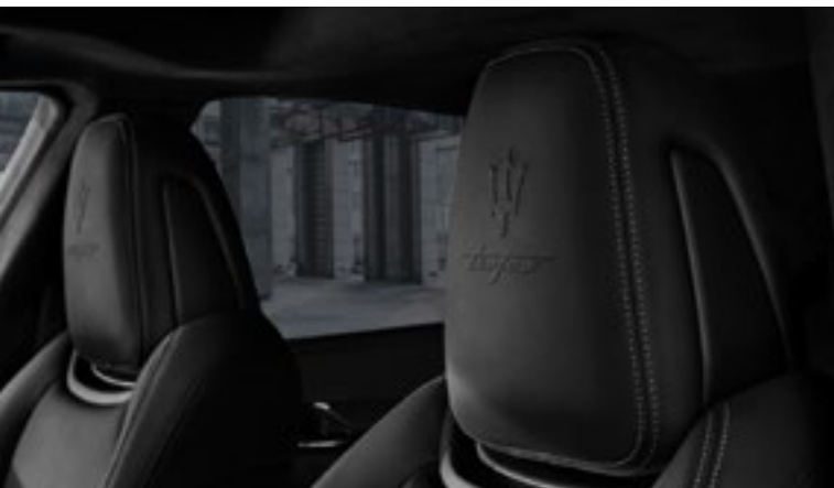
Quattroporte Trofeo - Headrest detail