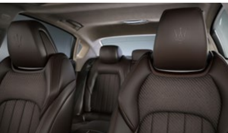
Quattroporte - Headrest detail