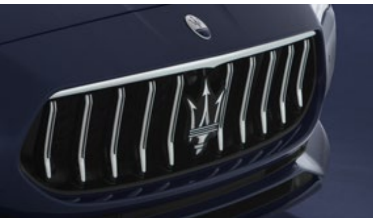
Quattroporte - Grille