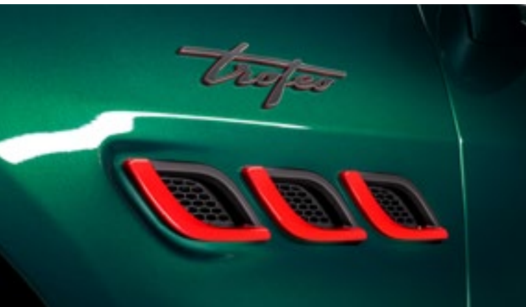
Quattroporte Trofeo - Side air vents and Trofeo Badge