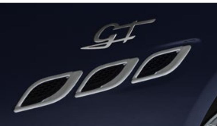
Quattroporte - Side air vents and GT Badge

The Quattroporte offers a combination of inspirational, high-capacity power and high-end business-like intelligence. So while it performs like a track-ready supercar, it's also remarkably efficient. Luxury, scale and space meet phenomenal dynamic capabilities in the Maserati Quattroporte – and it's all perfectly expressed by its stately yet dynamically intense exterior. With a perfectly balanced weight distribution, standard Skyhook suspension, Brembo dual-cast brakes, the Quattroporte blends phenomenal dynamics with complete comfort and safety.