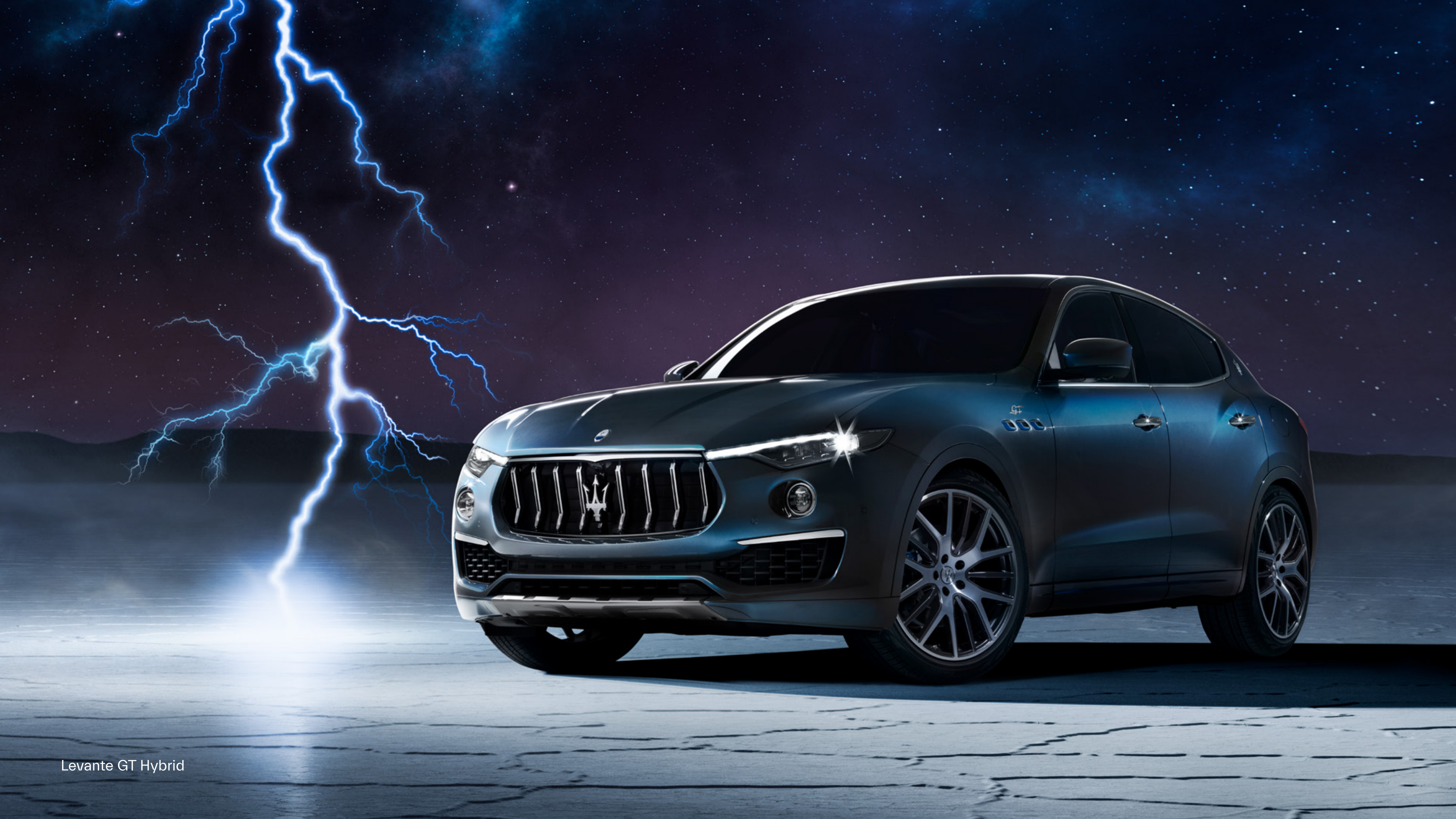
Levante GT Hybrid