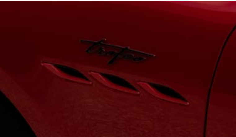
Ghibli Trofeo - Side air vents and Trofeo Badge