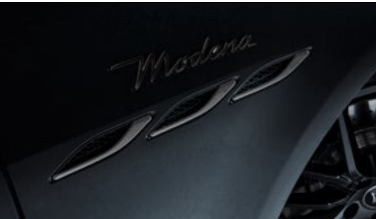
Ghibli - Side air vents and Modena Badge