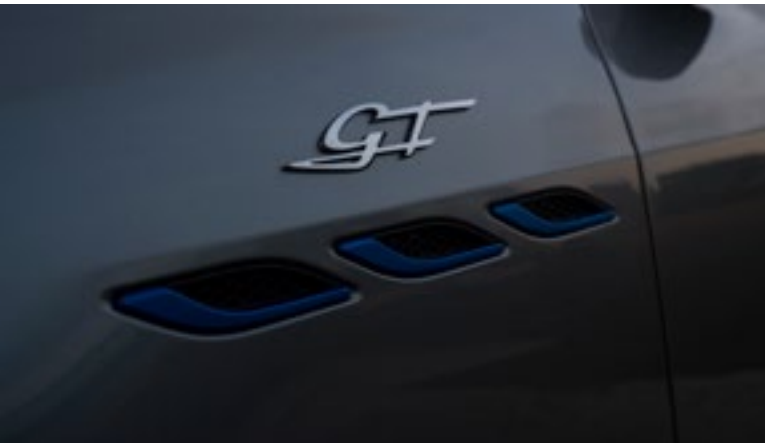
Ghibli GT Hybrid - Side air vents and GT Badge