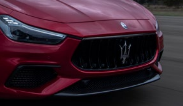
Ghibli Trofeo - Grille

Live audacious. Drive with character. Stand out in just 4.3 seconds with the ultimate Maserati Ghibli Trofeo. With 580 hp and a top speed of 326 km/h, the Trofeo is the most powerful Ghibli ever . Your bold statement that redefines the art of possible. The striking coupé look of the Ghibli, intensified by race-inspired design elements. High-gloss Carbon fibre on the front, the rear and on side air intakes, and the sculpted Trofeo bonnet with air extractors give you just a taste of what awaits as you grab its steering wheel . That’s how Ghibli Trofeo came to life. Born from race, enhanced by comfort with an innate sense for timeless beauty.