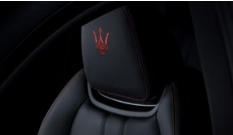
Ghibli - Headrest detail