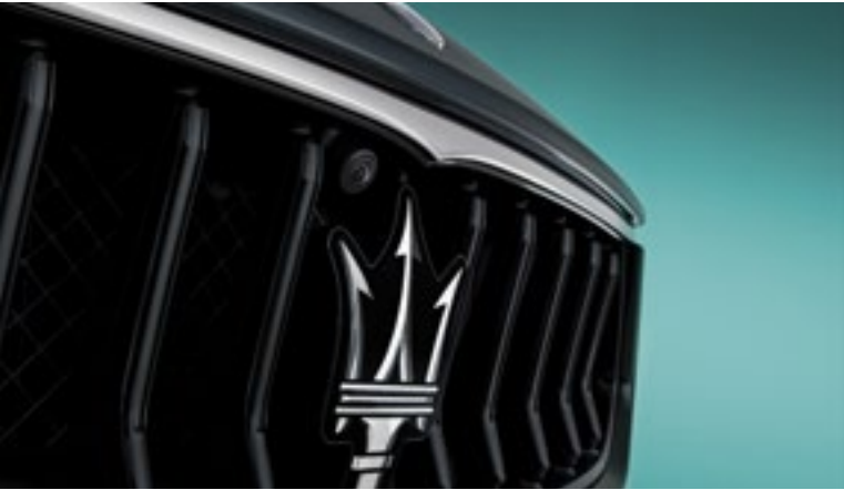
Ghibli - Grille