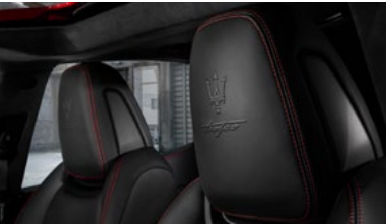
Ghibli Trofeo - Headrest detail