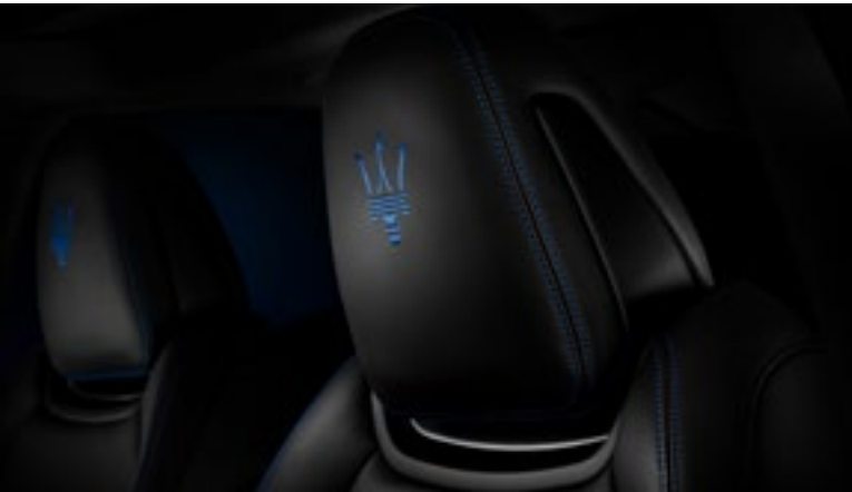
Ghibli GT Hybrid - Headrest detail