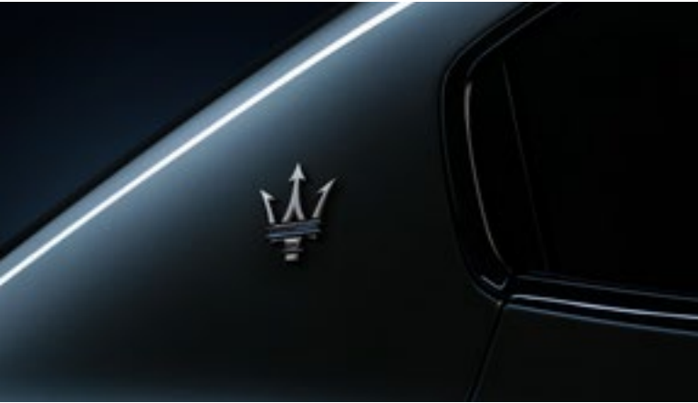
Ghibli GT Hybrid - Trident logo on C-pillar

The natural world is full of moments where a single spark evolves into something new – an instant where hybridization acts the catalyst for change. From the same inspiration comes the new Maserati Ghibli GT Hybrid : the first in a line of new vehicles, at the vanguard of a new Era for the Brand . The Ghibli GT Hybrid ignites Maserati’s future without betraying the past. The first hybrid engine in the history of the marque, where innovation and technology have always met with high performance automotive engineering, to drive Maserati forward towards a more sustainable future. Faster than diesel, greener than gasoline: the Ghibli GT Hybrid philosophy in a nutshell.