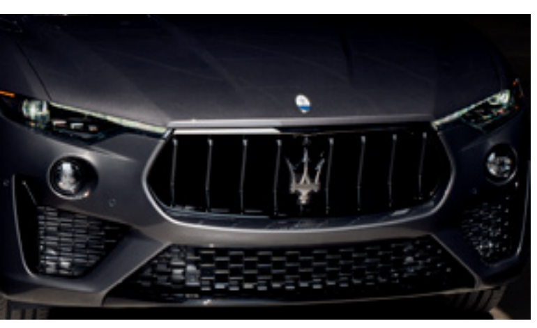
Levante - Grille