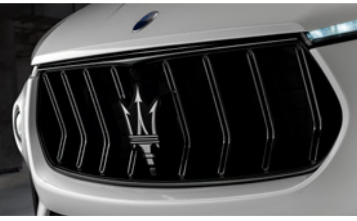
Levante Trofeo - Grille