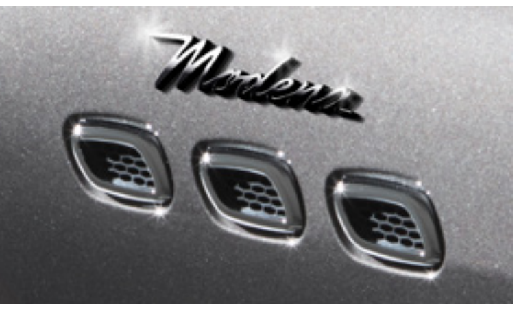
Levante - Side air vents and Modena Badge