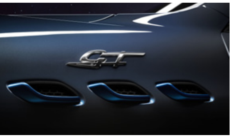
Levante GT - Side air vents and GT Badge