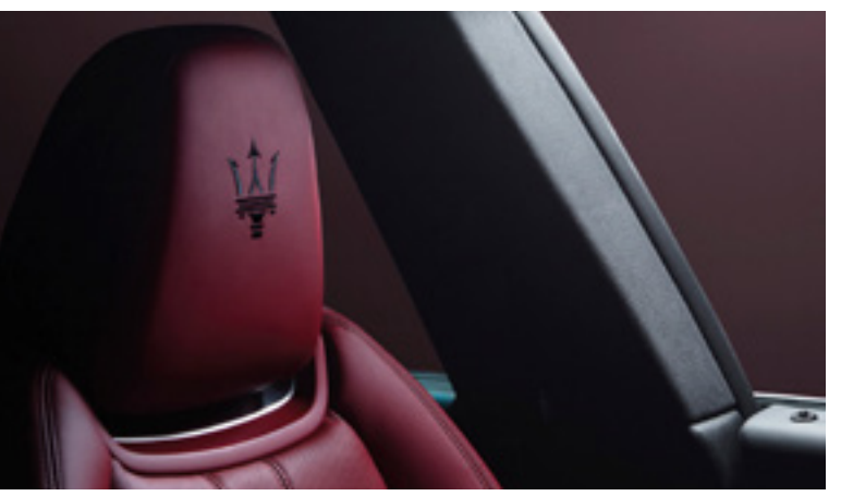
Levante - Headrest detail