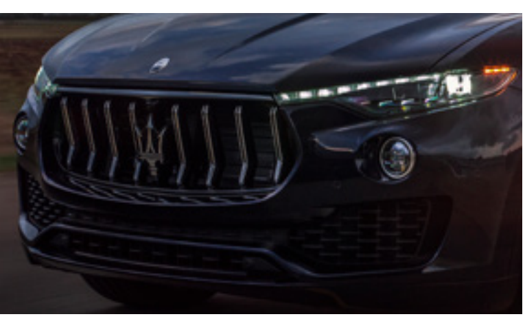
Levante GT - Grille