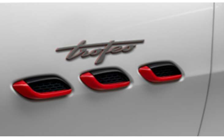
Levante Trofeo - Side air vents and Trofeo Badge