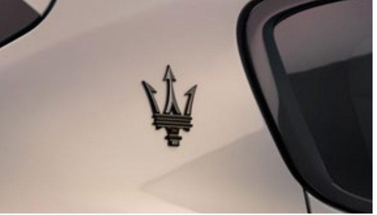
Trident logo on C-pillar