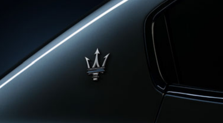
Ghibli GT - Trident logo on C-pillar