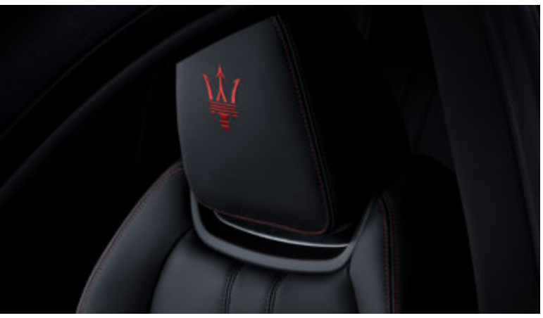
Ghibli - Headrest detail