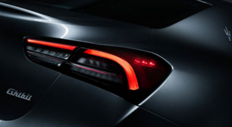
Ghibli GT - Rear headlight