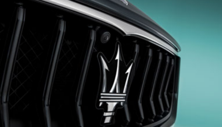
Ghibli - Grille

Whatever your choice or ambition, Maserati Ghibli always offers a uniquely inspirational answer.