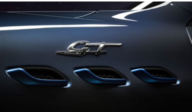
Levante GT - Side air vents and GT Badge