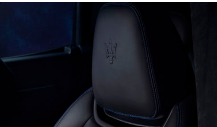
Levante GT - Headrest detail