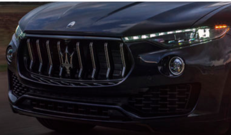
Levante GT - Grille

The Levante GT is the Maserati of SUVs that raises performance and style to new heights, with enhanced efficiency. Inspiring, electrifying, with the unmistakable Maserati roar . The hybrid technology in the new Levante is designed to magnify the exhilaration of every adventure you take. Accept no boundaries, pave the way with grand Maserati performance that always takes you further. The Levante GT covers 0-100 km/h in 6 seconds, with a top speed of 245 km/h. Mild hybrid technology by name, roaring Maserati power by life. The hybrid system uses 18% less fuel for the same performance of the 350 CV V6 petrol version.