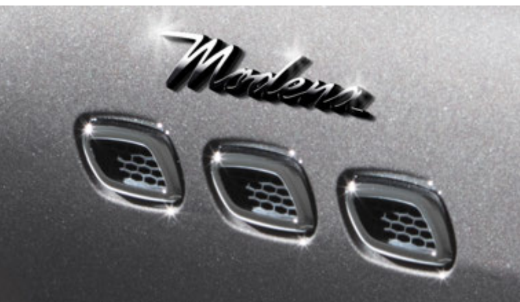
Levante - Side air vents and Modena Badge