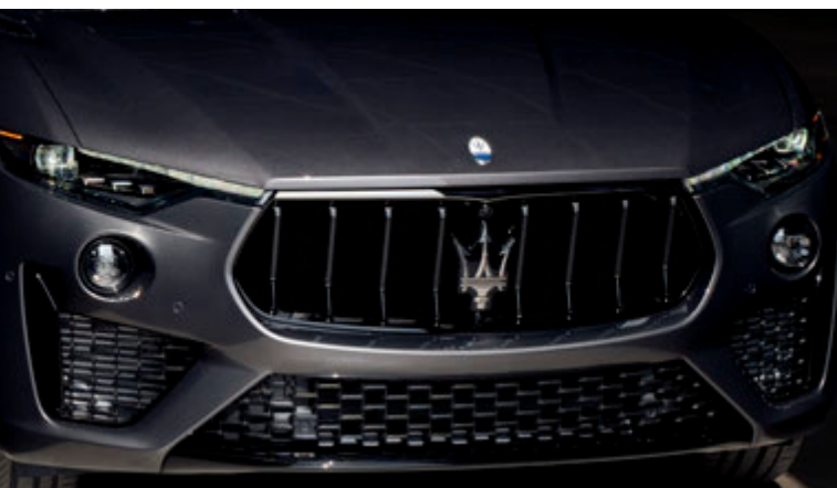
Levante - Grille