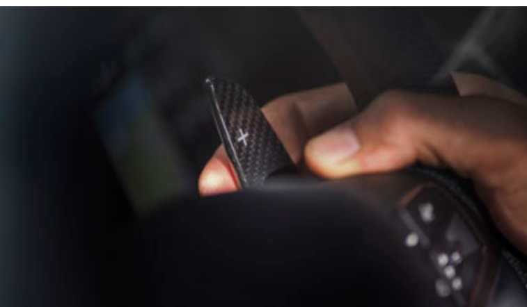
Levante - Paddle shifters